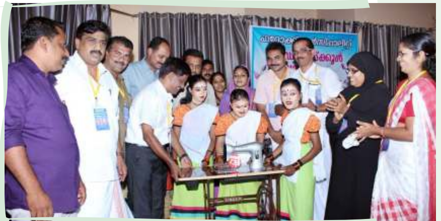
Donating weaving machine to Special School at Feroke