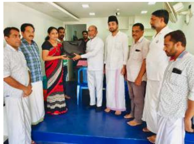
Receiving Alhind Charitable Foundation's 'Best Performance Award' in Ambulance Service