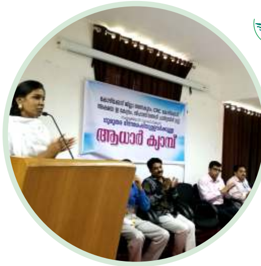
Aadhar Camp inaugurated by Vigneswari. IAS (Sub Collector, Calicut)