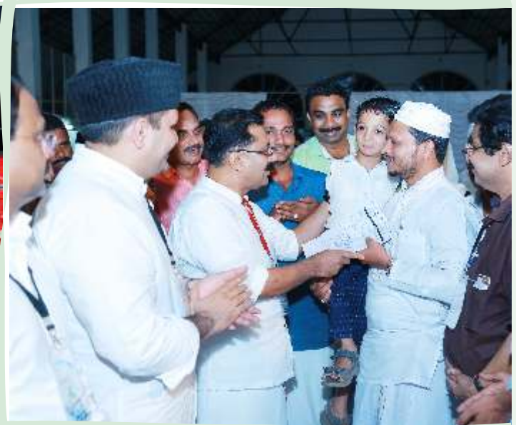
'Oppam' Project Inaugurated by Sri. K.T. Jaleel (Minister for Local Self-Governments, Welfare of Minorities, Kerala)