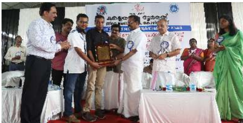
Receiving District Administration Calicut's 'Best Performance Award' in disability sectors from Sri. T.P. Ramakrishnan (Hon'ble Minister of Excise & Labour)