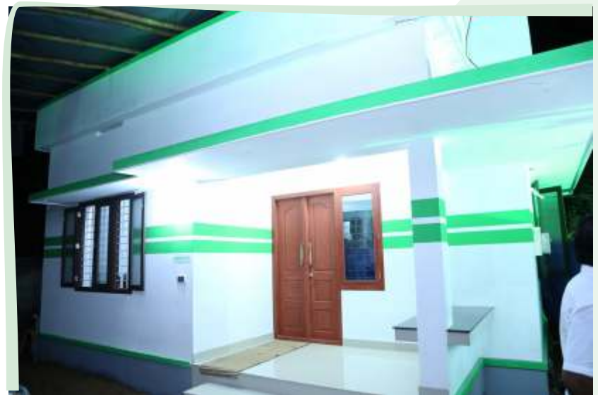
House after renovation and ready to handover

families cannot thrive. Our trust advances financial assistance to the houseless poor and for the renovation of the inhabitable houses of the needy. Let us help the homeless poor get a new life, through this scheme.