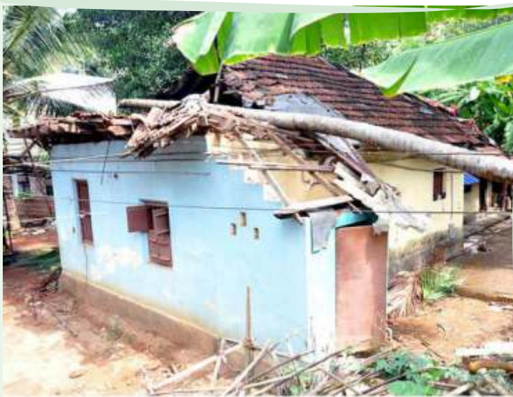
House before renovation