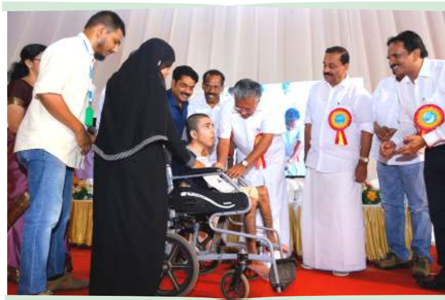
Medical Board Certificate Distribution by The Hon'ble Kerala Chief Minister Sri. Pinarayi Vijayan.

First of its kind effort in the country, of such a magnitude; in the disability sector 10,092 Applications received, 5091 Addressed as phase I, 26 Disability Medical Board Camps; 2404 Medical Board Certificates granted and 6 Legal Guardianship Adalaths, 747 Legal Guardianship Certificates issued. Shihab Thangal Charitable Trust is humbled to be a proud partner in the entire exercises of this great philanthropic initiative.